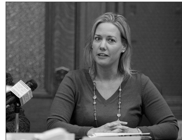
Rep. Kerkman testifies on AB 465 regarding intoxicated co-sleeping

intoxicated co-sleeping, but also requires new parents and teens to receive educational materials on the risks of intoxicated co-sleeping. As the number of deaths associated with impaired co-sleeping continues to climb, advocating for the passage of this bill is increasingly imperative and will remain amongst my top priorities this session.