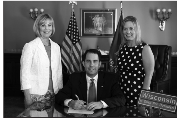
Rep. Kerkman and Senator Darling at the signing of the Foodstamp Bill

This piece of legislation delineates wrongful use of this assistance by defining the trafficking of SNAP benefits and allowing for the penalization of such activity. Examples of punishable activities include the buying, selling, or stealing of SNAP benefits for cash, using benefits to purchase items for the sole purpose of returning the items for cash refund, and the reselling of food purchased using SNAP benefits for cash. Penalizing the trafficking of SNAP benefits creates greater accountability within FoodShare and promotes the proper operation of this program.